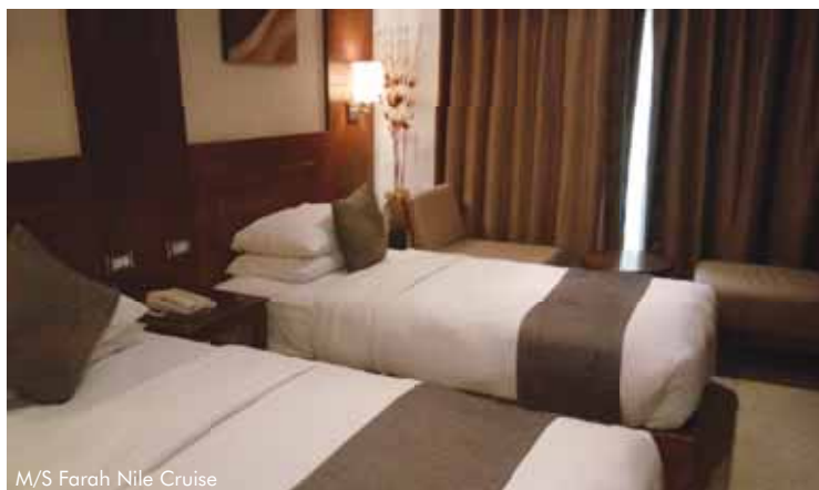
M/S Farah Nile Cruise