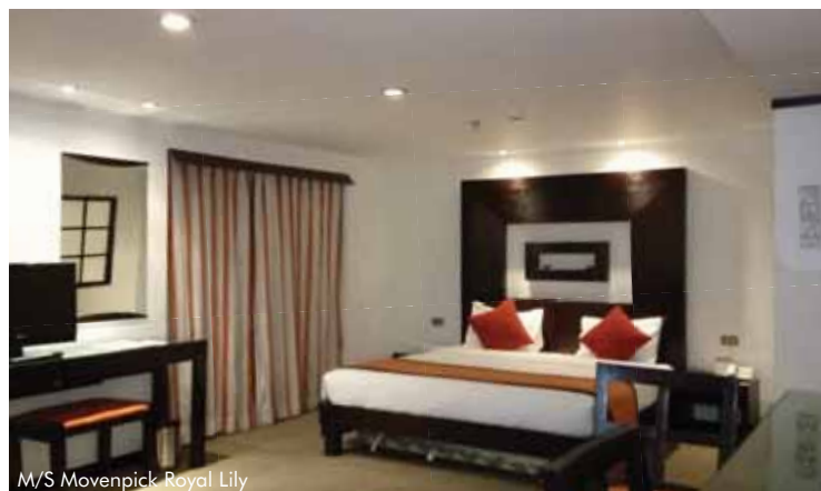
M/S Movenpick Royal Lily