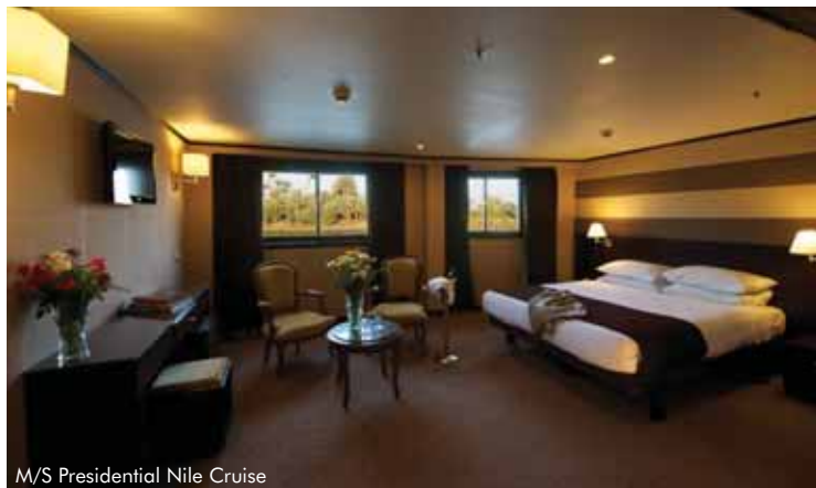
M/S Presidential Nile Cruise