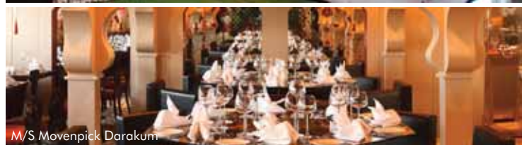
M/S Movenpick Darakum