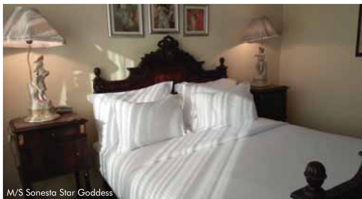
M/S Sonesta Star Goddess