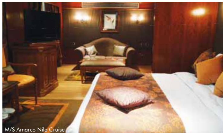
M/S Amarco Nile Cruise